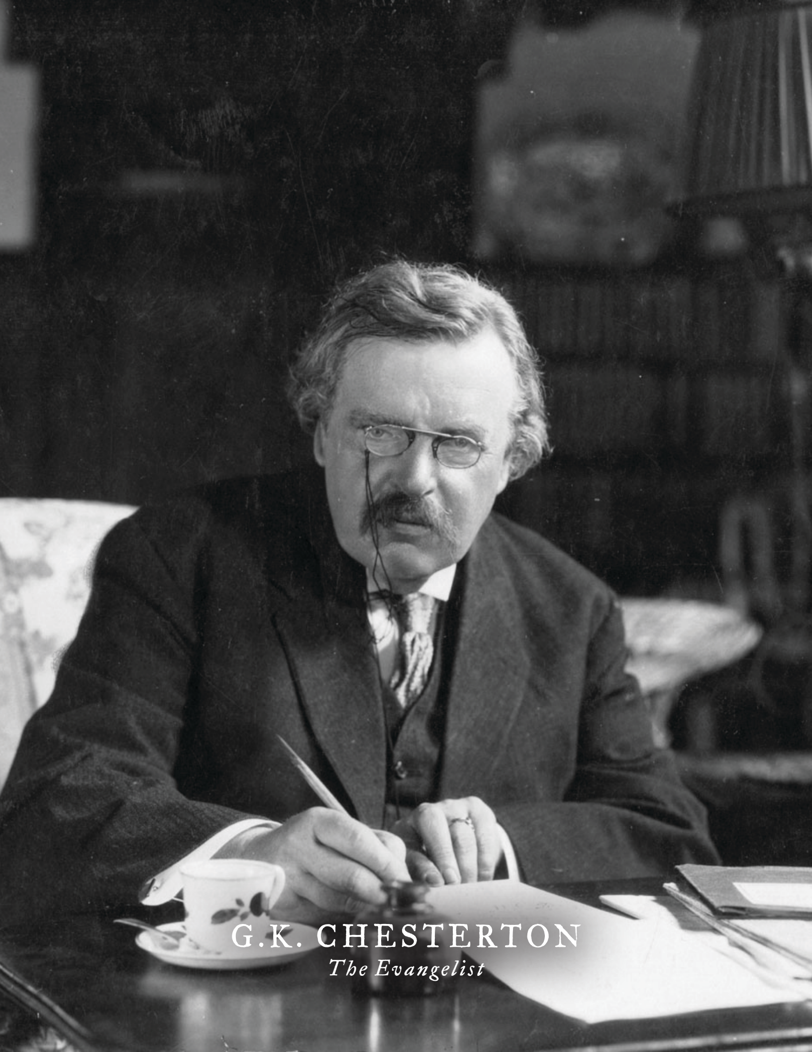
G.K. CHESTERTON The Evangelist